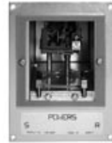
186 Duct Hygrostat.