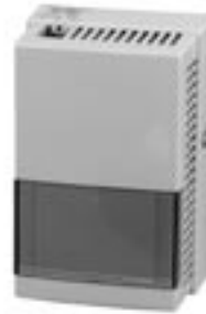
186 Room Hygrostat.